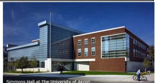
Simmons Hall at The University of Akron

Fall & Spring Office Hours: Monday, Tuesday, Thursday, & Friday 8 a.m.-5 p.m. Wednesday: 8 a.m.-7 p.m.